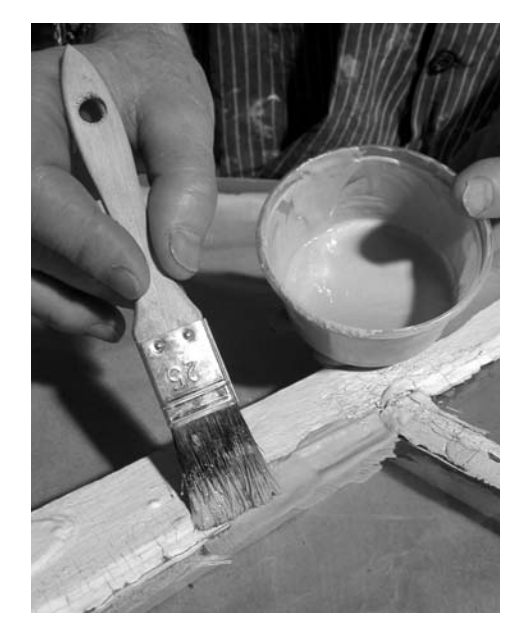
Windowcraft – Part Two