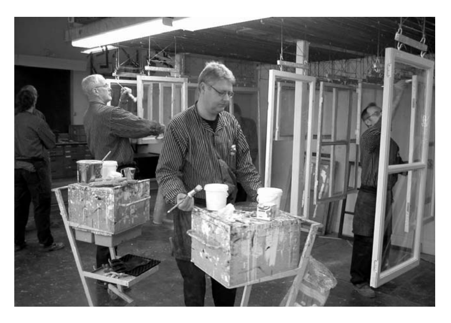
Figure 4 Students at Bjäresjö School, Ystad learning how to use solvent-free linseed-oil paint manufactured by local raw flax material.