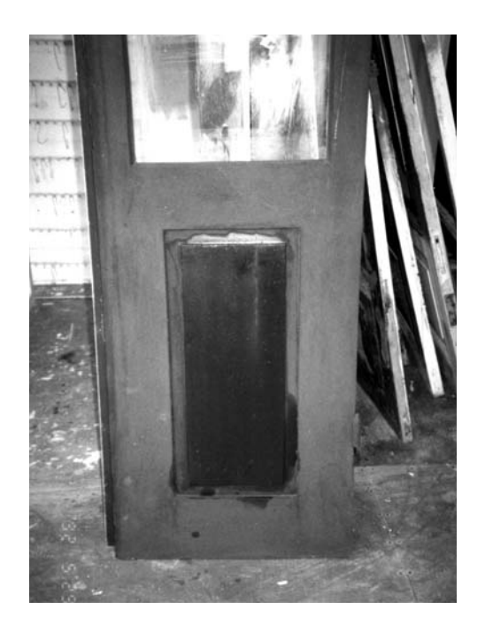
Figure 3 Maintenance of an old door, after nine years, with boiled linseed oil or linseed-oil wax.

Depending on position and exposure, maintenance is usually simple. Just clean the surface with, for example, ammonia or ethanol and let it dry. A brass brush can also be used. If the surface is brushed and cleaned and fresh boiled linseed oil or linseed-oil wax is applied, the surface will regain its former gloss and function (Figure 3). In the case of surfaces that are painted white, add a little white-colour pigment (titanium dioxide) to avoid the surface yellowing.