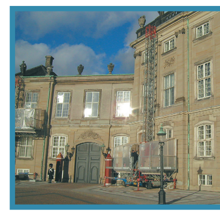
Allbäck Paint for The Royal Castle, Copenhagen, Denmark.