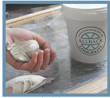
Linseed Oil glazing/putty.