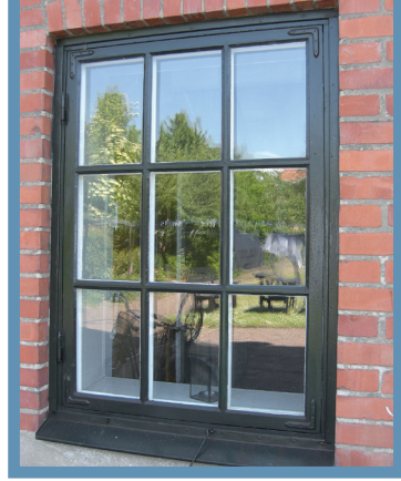
25 years after renovation. Maintained with Linseed Oil only.

The linseed oil soap is extracted from cold pressed raw linseed oil. This is a completely organic product without any additives. We suggest using the linseed oil soap for cleaning paint brushes and other painting tools. It is also excellent for general house hold cleaning.