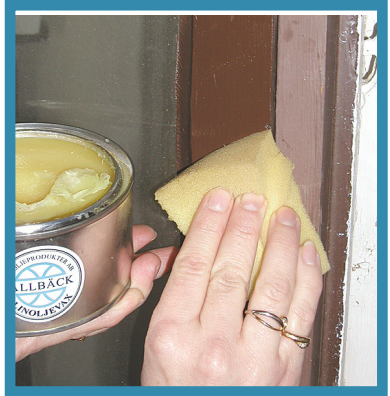
Maintaining surface with Linseed Oil Wax