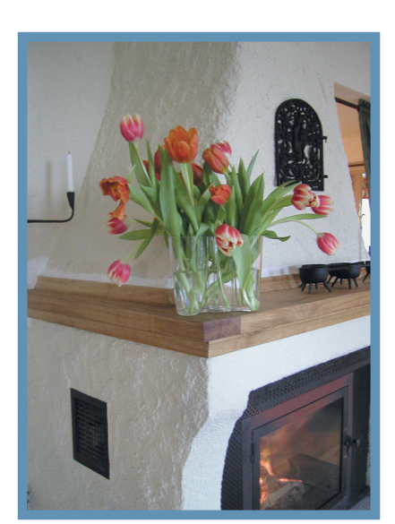
Organic Linus Interior Wall Paint.