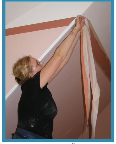
Linus Interior Wall Paint.