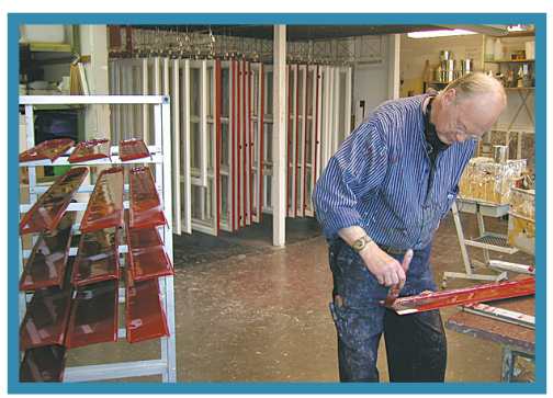
Painting of window sashes and metal flashing at the factory workshop.

and modern technology. As a result of this we can offer you this amazing paint system for exterior and interior applications without all the detrimental effects usually combined with painting today. You can say that things have come full circle, old appears to be better than the best modern chemically produced paint. The elimination of hazardous material in the workplace and home is now possible.