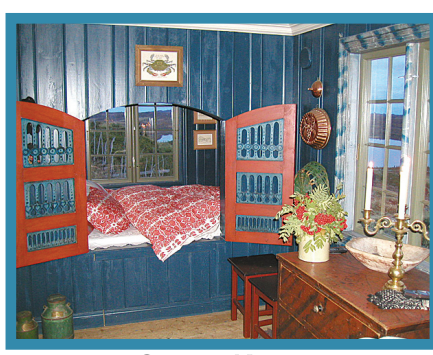
Cottage in Norway.