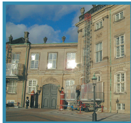
Allbäck Paint for The Royal Castle, Copenhagen, Denmark.