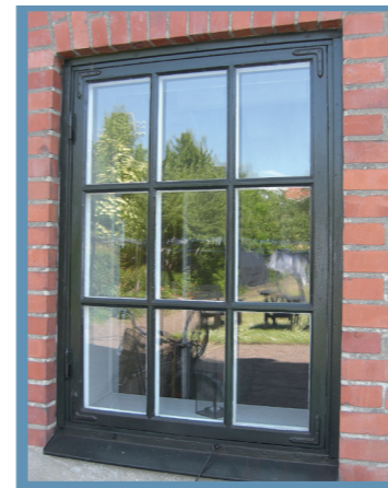
25 years after renovation. Maintained with Linseed Oil only.

The linseed oil soap is extracted from cold pressed raw linseed oil. This is a completely organic product without any additives. We suggest using the linseed oil soap for cleaning paint brushes and other painting tools. It is also excellent for general house hold cleaning.