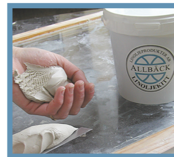
Linseed Oil glazing/putty.