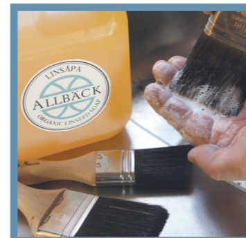
Cleaning brushes with Linseed Soap.