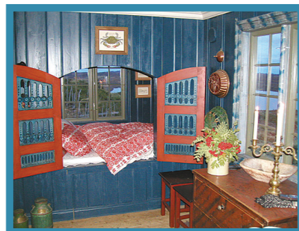
Cottage in Norway.