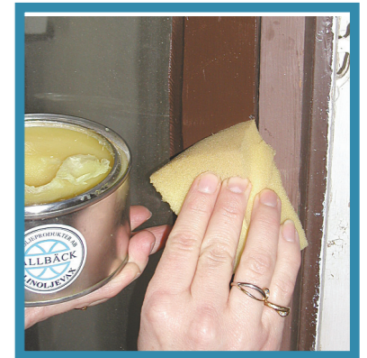
Maintaining surface with Linseed Oil Wax.