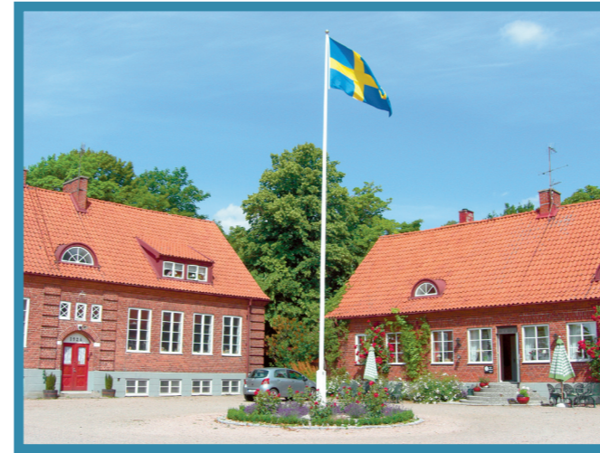
The Allbäck Research Laboratory and Production Facilities.