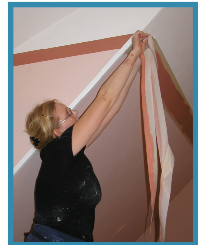
Linus Interior Wall Paint.