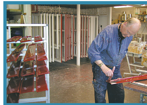
Painting of window sashes and metal flashing at the factory workshop.