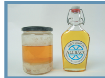
The Organic Linseed Oil is purified & sterilized.